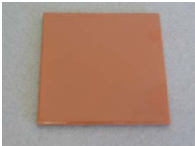
Table 8. Pictures of The Tested Specimen